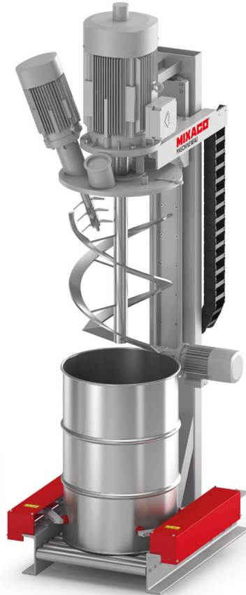
Speedy™ D MT